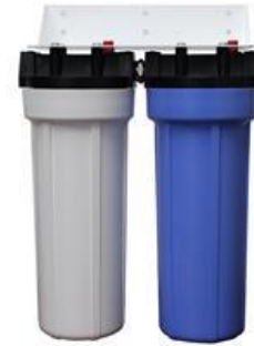
Silver Ion filter & 5 microns PP pre-filter

The SK humidifier is equipped with an optional 5 microns PP pre-filter and silver ion filter option. The 5 microns PP pre-filter and silver ion dosing cartridges are designed to prevent microbial growth.